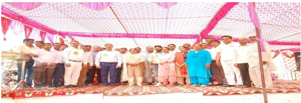
(School's devoted team ready to serve the education in new session 2019)