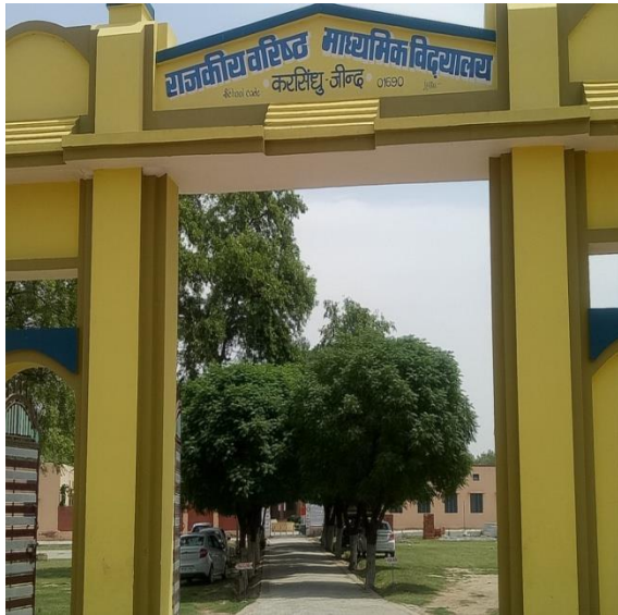
(Front View of school)