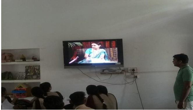
(Students watching the EDUSAT Programme)

3 Peer Teaching: Focus was given group teaching, in which class was divided in 3-4 groups. Each group is challenged to discover their best to think independently and act ethically for need based care.