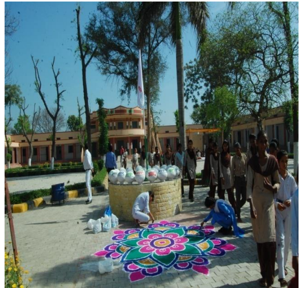
(Entry with rangoli of flowers during school programme)