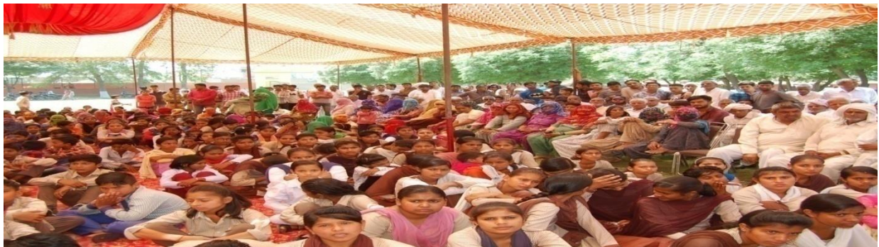
(Organizing Parents Teachers Meeting)

We select the interactive mode of feedback between parents & teachers rather than unidirectional approach as generally done by teachers. This helped in understanding the nature of students at home & changes the attitude of the parents with regard to their children's education & discipline.